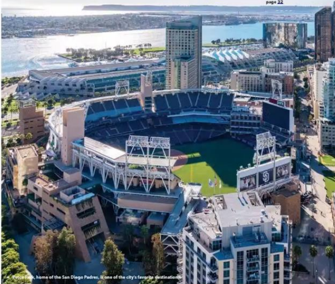
Petco Park, home of the San Diego Padres, is one of the city's favorite destinations.