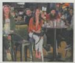
Live events are back in PB SEE PAGE 4